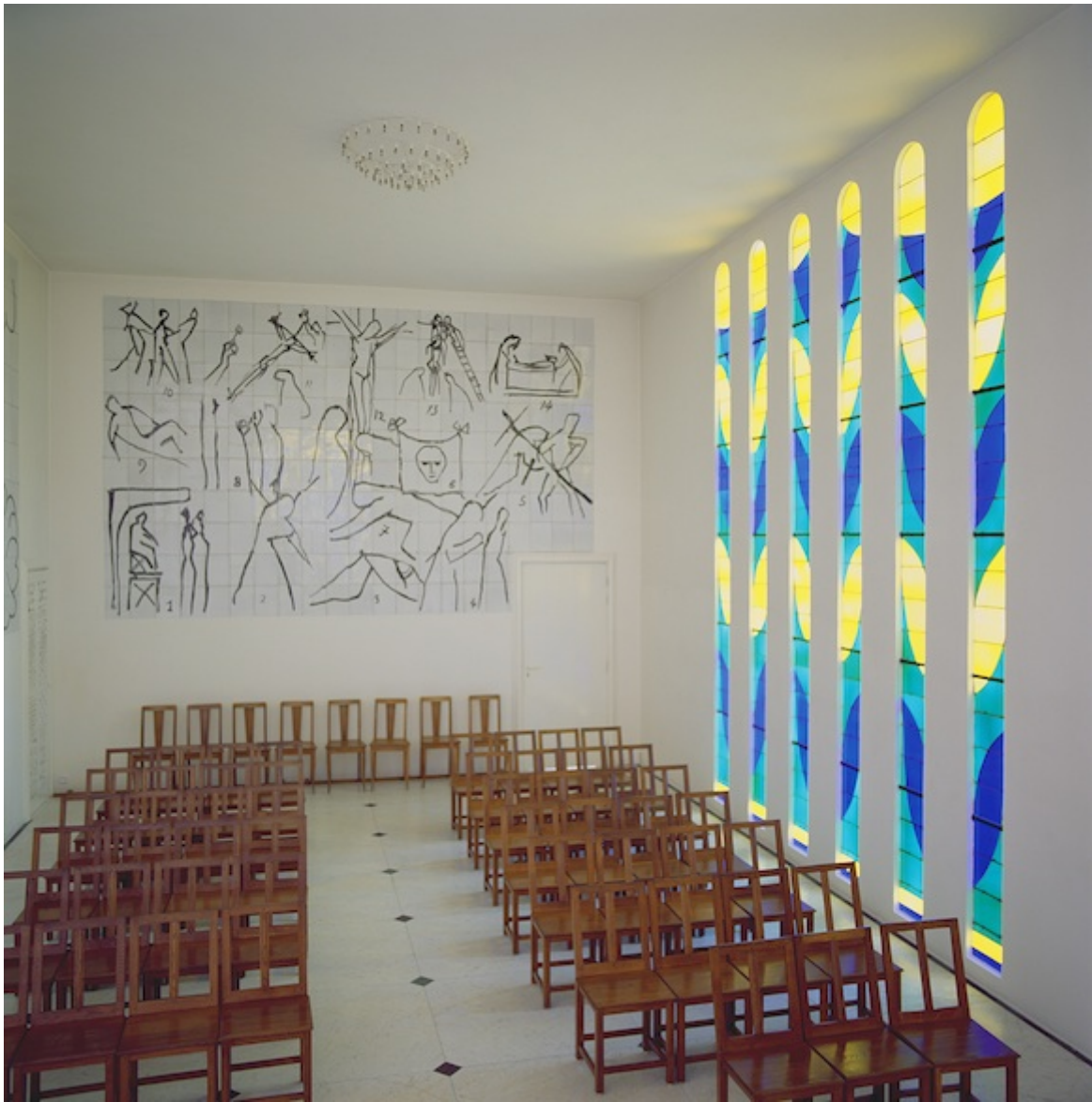
Fig. 1: View of the Nave, Stained-Glass Side Window and Stations of the Cross in the Chapelle du Rosaire, Vence, France, 1948–51 (stained glass and ceramic tile), Matisse, Henri (1869-1954) / Chapelle du Rosaire, Vence, France