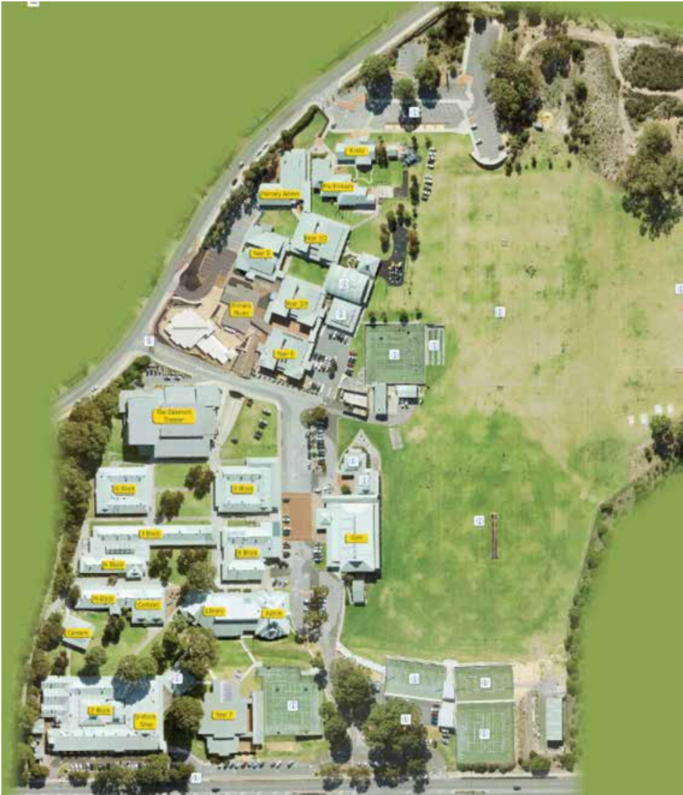
Meadow Springs Campus