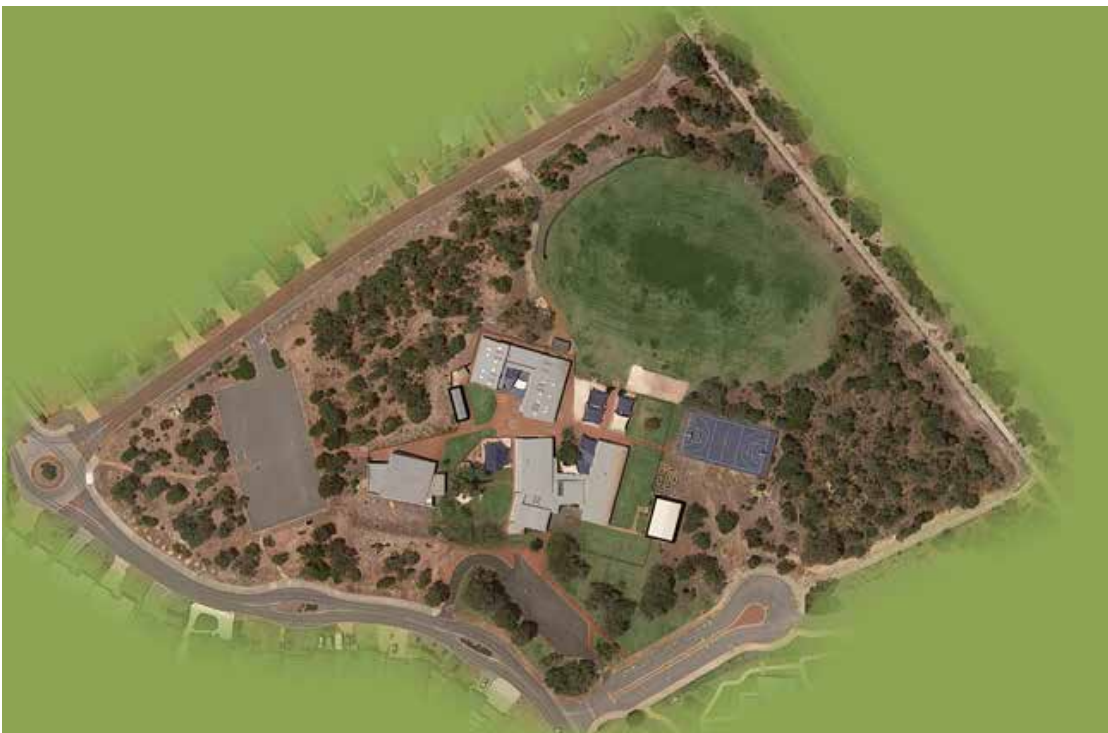
Halls Head Campus