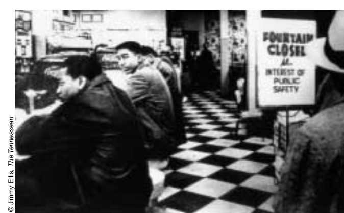
Sit-in at Walgreen's lunch counter in Nashville, February 1960

Mobilizing and sustaining a popular movement geared to nonviolent action go hand in hand with forming a civil society and sustaining democracy.