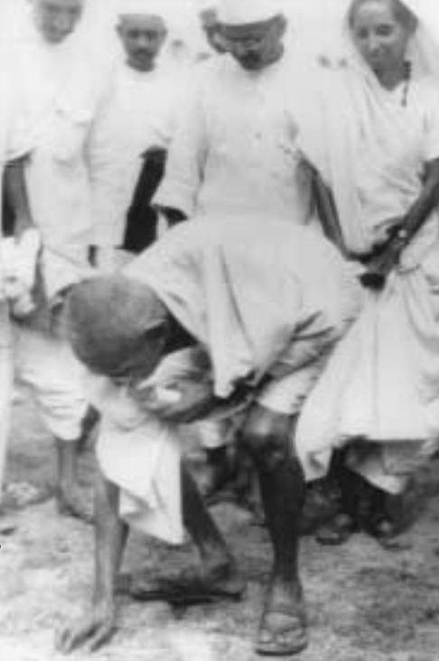
Gandhi gathers salt on his march in India, 1930

thousands to jail. The campaign continues into March 1931, when the British vicerov Lord Irwin invites Gandhi to talk: the government will end the repression and consider giving India more autonomy if Gandhi will call off the campaian. Gandhi agrees, and civil disobedience ends for a time. It has failed to dislodge the British, but it has awakened millions of people to their own power and laid the foundation for India's independence, which eventually comes in 1947.