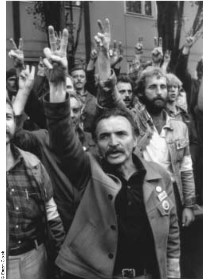
Polish workers strike, 1980

Cook, Robert. Sweet Land of Liberty? The African-American Struggle for Civil Rights in the Twentieth Century. London: Longman, 1998.