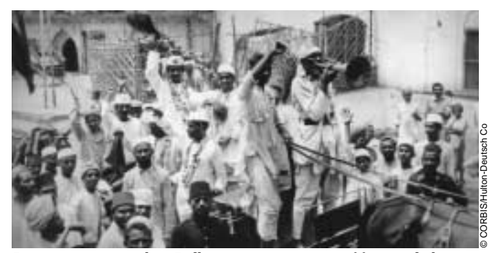
Demonstrators march in Delhi against importation of foreign cloth, 1922

Gandhi's core ideas took shape not in India, but in South Africa, where he went to make a living as a young lawyer in the 1890s. Indians, like other non-European people in South Africa, were subject to severe discrimination. White officials