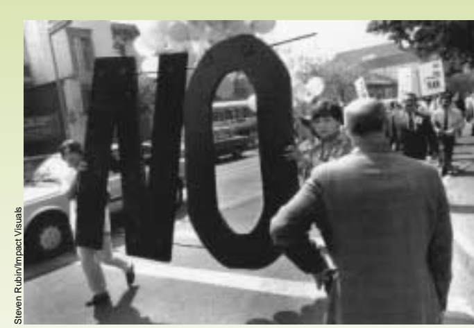
Party for Democracy (PPD) march for "No" vote, March 1988

October 5, 1988 — Plebiscite ends in victory for those opposing a continuation of Pinochet's dictatorship.