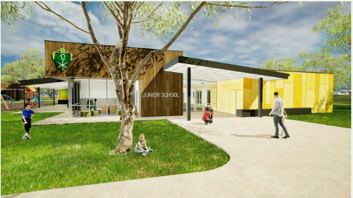
The Junior School building will house students from Prep to Year 4.