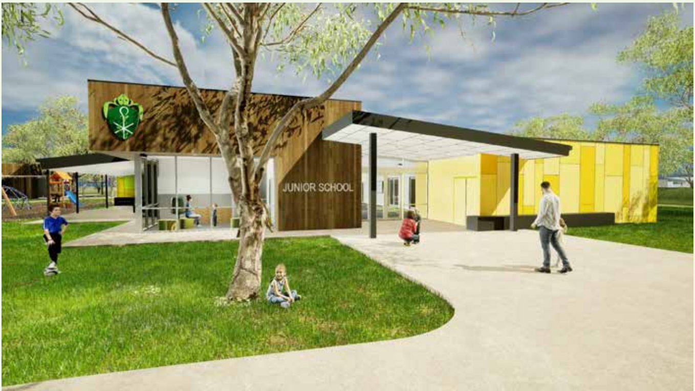
The Junior School building will house students from Prep to Year 4.